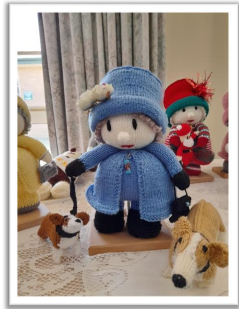
The Queen in different outfits.