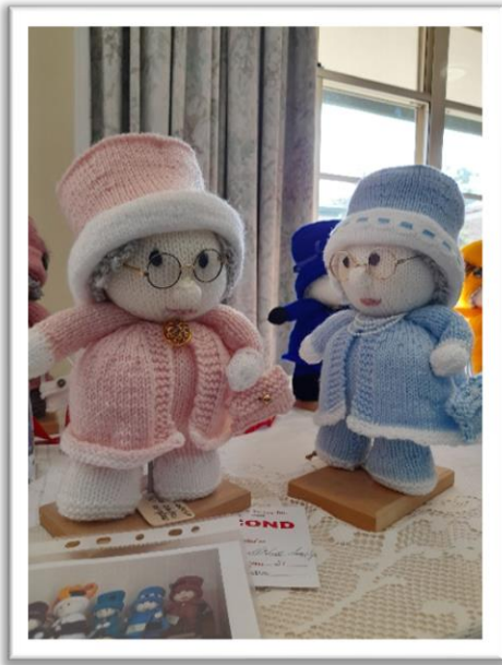
The Queens Christmas out fit with a Santa.